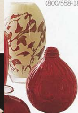
PHOTOGRAPH: GLASS VASES

Time vases, bowls, and baskets in the same color or tone against a white wall. A mass of color next to white. Colorful objects don't have to be the table's focus. Simply place dishes and let treasures in the scheme and steal the show. A red-and-ivory vase: "Floating Islands" by Karim Rashid (800/351-9842). "H 2 O," $340; "Monofiore," $290; and "Opalini," $800; all from Venini through Bergdorf Goodman (800/558-1855).